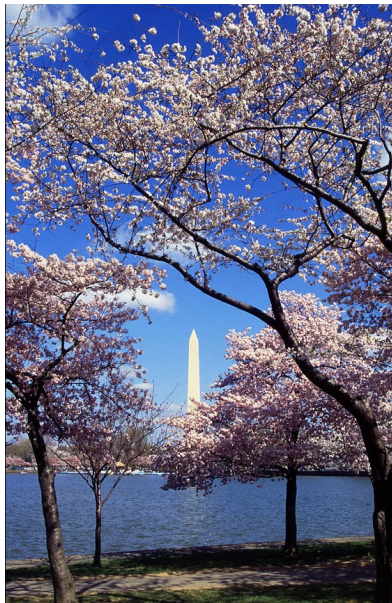
The Washington Monument, as seen from West Potomac Park across the Tidal Basin