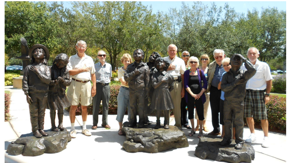
Part of the group that visited the Raymond James Art Collection in July, in the adjacent garden with its statues, see page 4

Remember, you only need 4 correct answers to pass. Check your answers in the next page.