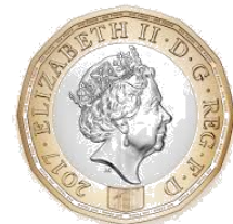
new £1 coin