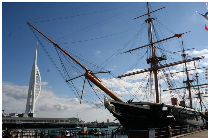
HMS Warrior with the Spinnaker Tower.

The City of Portsmouth is also home to The Royal Marines Museum, The D Day Museum and a Royal Navy Submarine to view. It has other historical strings to its bow, being the birthplace of Charles Dickens and is the only English City built on an island. From Portsmouth, ferries take visitors to the Isle of Wight and also further afield, to France and Spain. Visitors can ride to the top of the Spinnaker Tower, Portsmouth's Millennium project for a fantastic view of the area on a good day. Charity abseils [rappeling] are also done on a monthly basis from this building.”