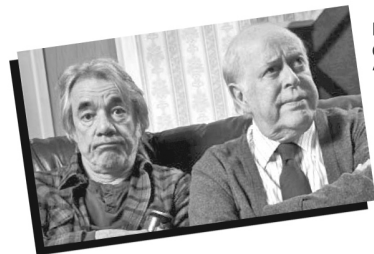
Roger Lloyd-Pack (l) and Clive Swift (r) star as a modern-day "Odd Couple" in OLD GUYS.

Spend Saturday nights with WEDU and your favorite BritComs!