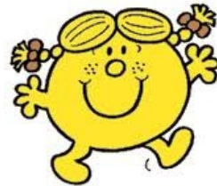
LITTLE MISS SUNSHINE

The Club would like to thank the following merchants for their cooperation in spreading the good word about our Club by allowing the BritClub News to be distributed in their premises: Word of Mouth (3), Champions Pub, Tastefully British, 4 & 20 Pasty Company, The Open Pub & Restaurant, The King George Pub, Beckham's, The White Horse Pub, McAllister's, Scot's Corner, British Open Pub & Restaurant of Venice, Bentley's Resort Hotel, Scrambles, Ezpiez, Yellow Strawberry Salon (LWR), Simon's Coffee House and Café Continental Patisserie.