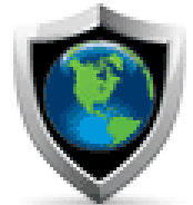
The ExPat Shield logo.