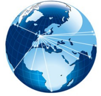
The ExPat Surfer logo.

If there are other websites that you cannot access from the USA, this claims ‘Get a UK IP and access content available only in UK from anywhere. Ensure complete freedom to access all information and content online.’