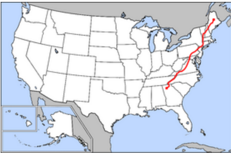
The Appalachian Trail, about 2200 miles from Springer Mountain to Mount Katahdin in Maine.

Steve's blog is created using WordPress, free software that you can download from <a href="http://wordpress.org/">http://wordpress.org/</a>