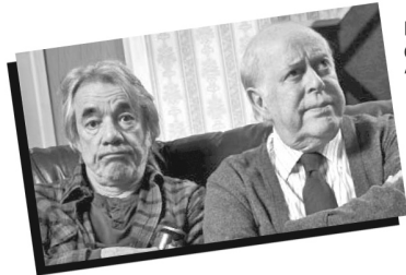
Roger Lloyd-Pack (l) and Clive Swift (r) star as a modern-day "Odd Couple" in OLD GUYS.

Spend Saturday nights with WEDU and your favorite BritComs!