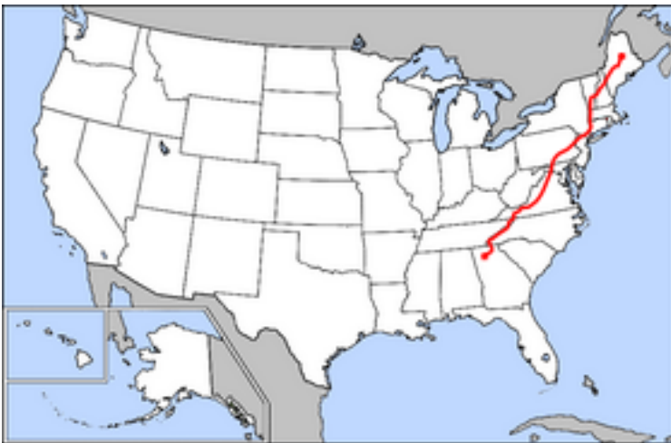
The Appalachian Trail, about 2200 miles from Springer Mountain to Mount Katahdin in Maine.