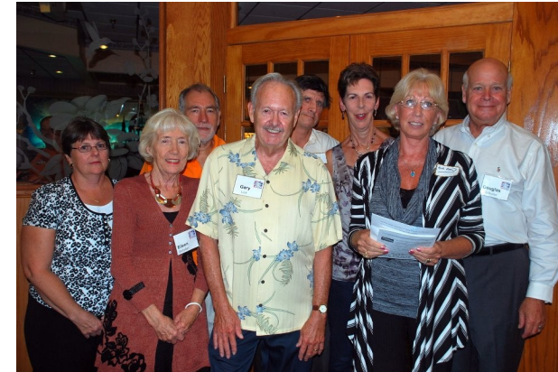
Most of the 2012 Board at the AGM.