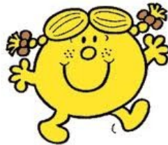
LITTLE MISS SUNSHINE

The Club would like to thank the following merchants for their cooperation in spreading the good word about our Club by allowing the BritClub News to be distributed in their premises: Word of Mouth (3), Champions Pub, Tastefully British, 4 & 20 Pasty Company, The Open Pub & Restaurant, The King George Pub, Beckham's, The White Horse Pub, McAllister's, Scot's Corner, British Open Pub & Restaurant of Venice, Bentley's Resort Hotel, Scrambles, Ezpiez, Yellow Strawberry Salon (LWR), Simon's Coffee House and Café Continental Patisserie.