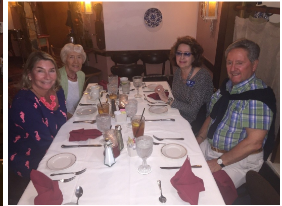
Friday lunch at Miguel's on Siesta Key.