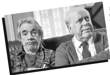
Roger Lloyd-Pack (l) and Clive Swift (r) star as a modern-day "Odd Couple" in OLD GUYS.