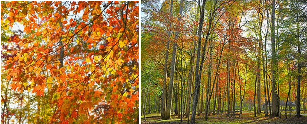
Some colors of Autumn in Florida...