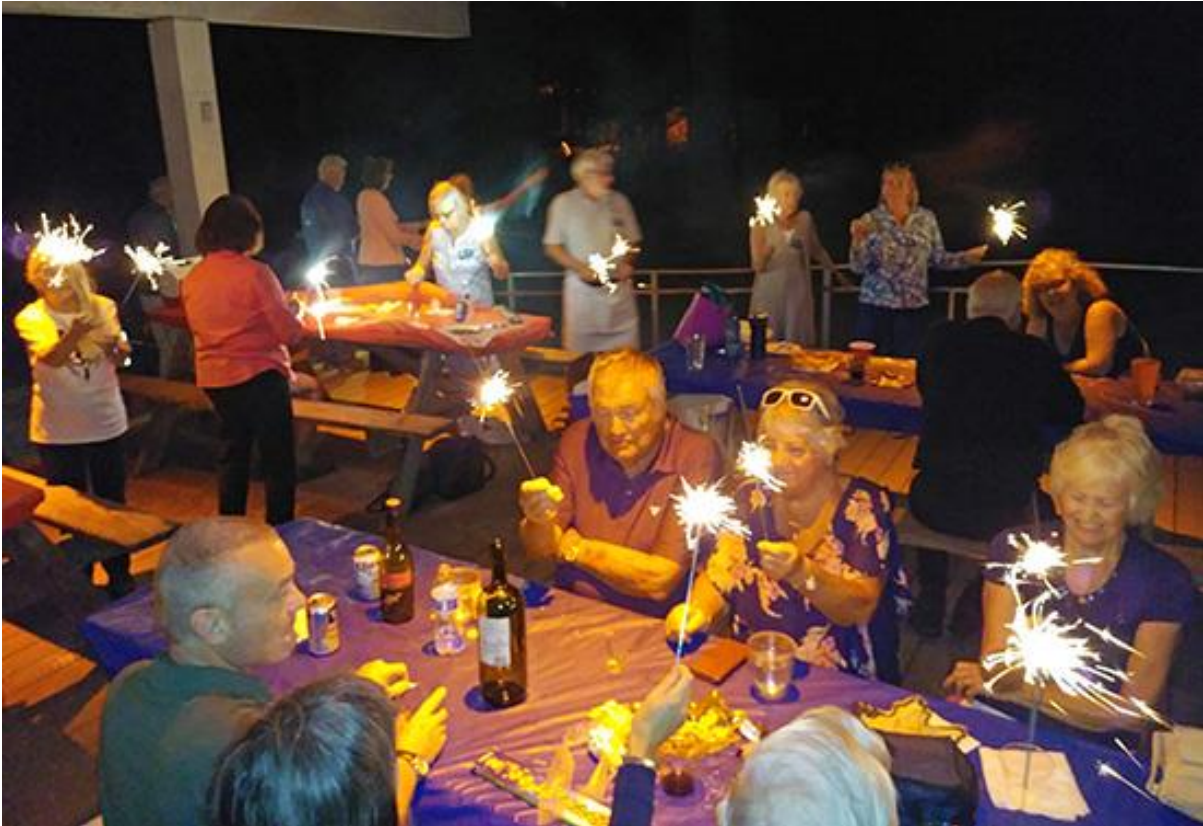
...and the Guy burned!