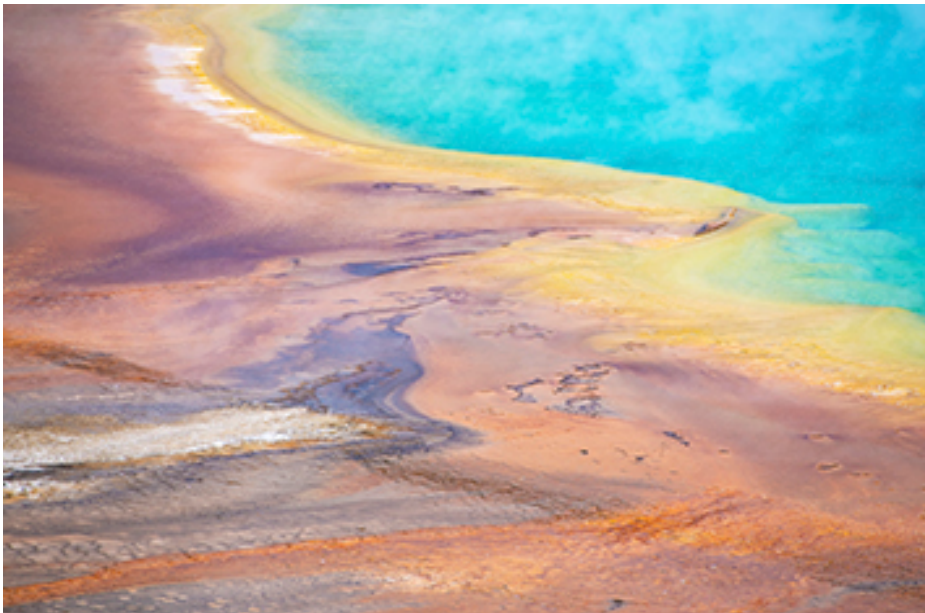
Yellowstone National Park 2019

The editor wishes to thank all the club members who have contributed to this edition.