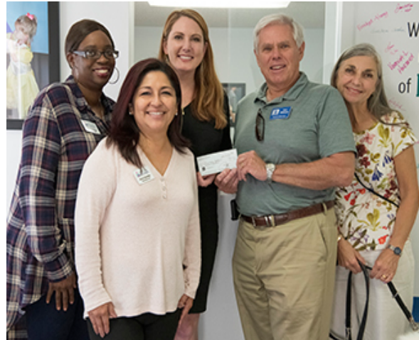
All Faiths Food bank