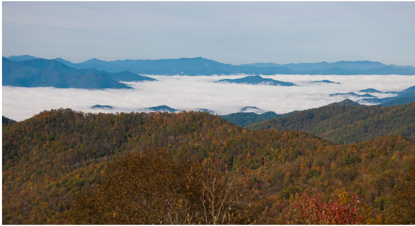
Autumn morning in the Smoky Mountains

Many thanks to News channel ABC 7 and their reporters for acompanying us during this time and also to the members who have contributed to this edition.